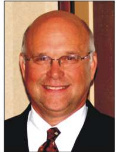
Mayor SAM RIKARD