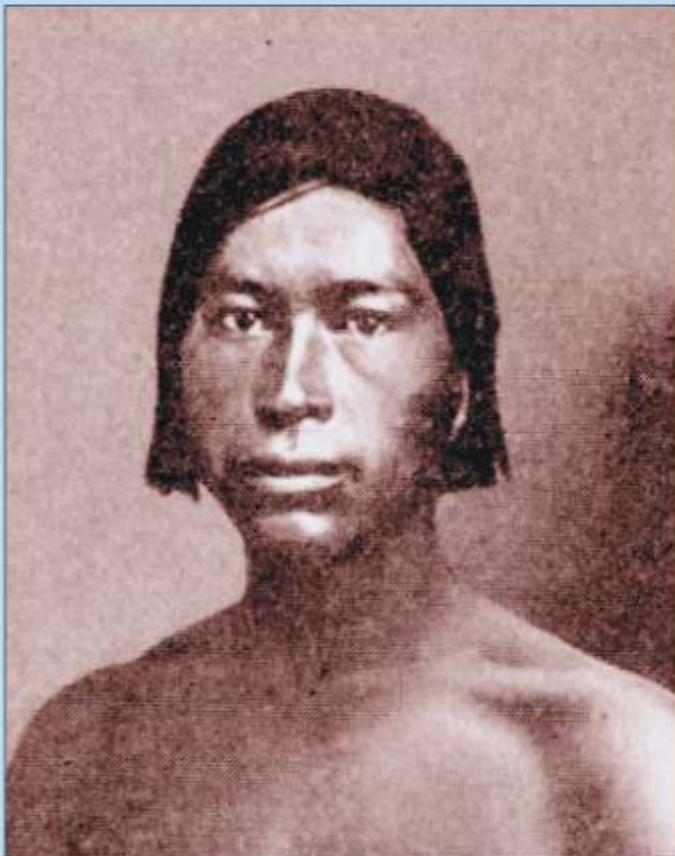
Young Chickasaw Warrior

The Chickasaw never lost a war until the mid-nineteenth century after they had moved to Oklahoma when they fought alongside the South in the American Civil War . Even then, at war's end, they were the last Confederate force to surrender to the Union Army . ☺