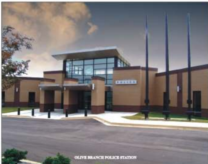
OLIVE BRANCH POLICE STATION