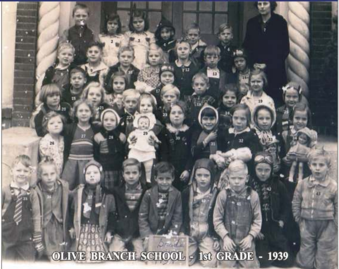
OLIVE BRANCH SCHOOL - 1st GRADE - 1939