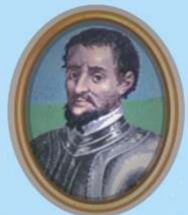
French Louisiana Governor, JEAN-BAPTISTE LE MOYNE, SIEUR DE BIENVILLE (left) and Spanish Explorer, HERNANDO DESOTO (right) both had their armies defeated by the Chickasaw.