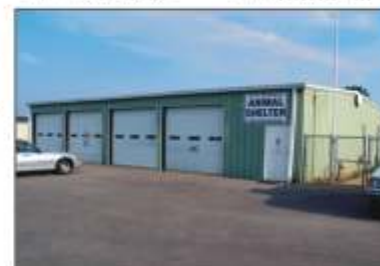
OLIVE BRANCH ANIMAL SHELTER - 7100 Stateline Road