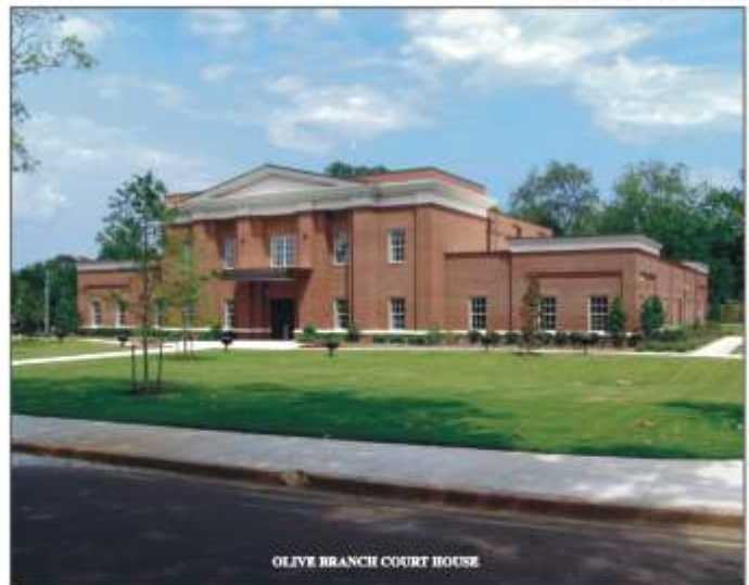
OLIVE BRANCH COURT HOUSE