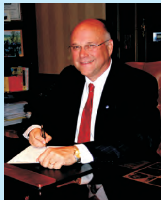
Mayor SAM RIKARD signs Proclamation