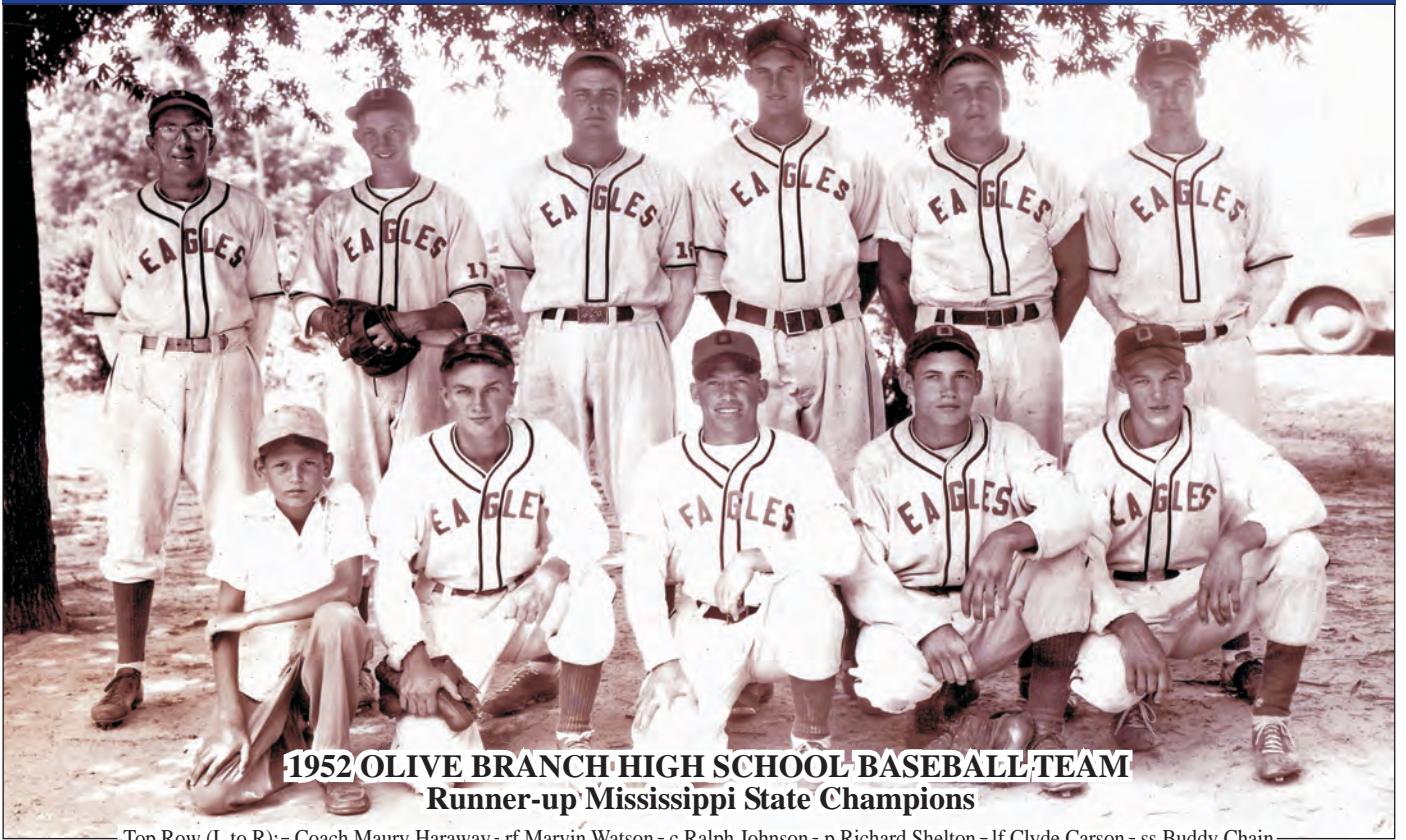
1952 OLIVE BRANCH HIGH SCHOOL BASEBALL TEAM Runner-up Mississippi State Champions