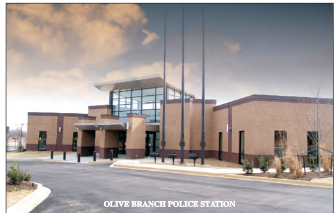
OLIVE BRANCH POLICE STATION